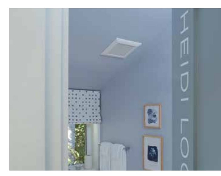
Whisper ventilation fan

Rounding out the ventilation system, Panasonic's highperformance Whisper ventilation fans quickly remove damp, stuffy air from Haus Heidi's designer bathrooms. Each ENERGY STAR® Certified fan keeps the air fresh and dry, preventing growth of harmful mould spores.