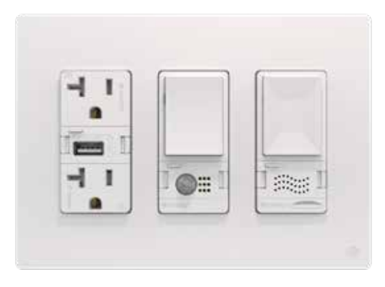
Swidget smart devices

Control of the new air quality system has been made as efficient and user friendly as possible with Swidget smart technology. Swidget pairs smart-ready outlets and switches with modular, interchangeable inserts that have a wide range of smart sensing capabilities. "Using the Swidget app on your smartphone allows you to create a variety of automations for convenience, energy monitoring, security, smart ventilation and much more," says Chris Adamson, Swidget Co-Founder and COO. Thanks to Swidget smart devices, each component of the IAQ system can run automatically in the background while Haus Heidi's occupants focus 100% on their vacation.