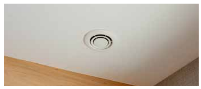
WhisperAir Repair air purifier

In keeping with Panasonic's healthy home philosophy, ClimaPure mini splits clean the air even as they provide heating or cooling. Each indoor unit is equipped with Panasonic's patented nanoe X air purification technology that simultaneously eliminates odors and inhibits allergens. Compact, ceiling-mounted WhisperAir Repair air purifiers, also with nanoe X technology, have been added in key areas of the house for extra purification.